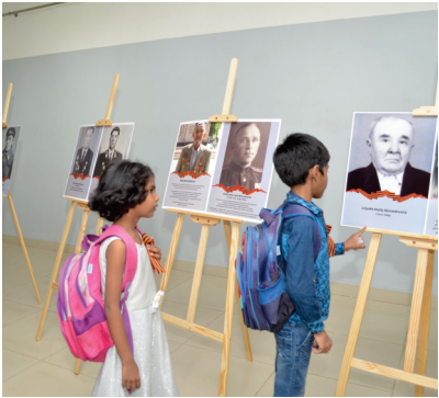
School children enjoy the exhibition