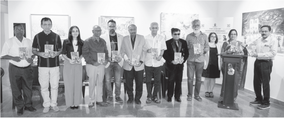
The dignitaries at the book launch