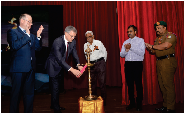
The Consul General lights the traditional lamp to mark the inauguration of the festivities