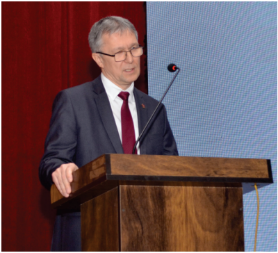
The Consul General addressing the gathering