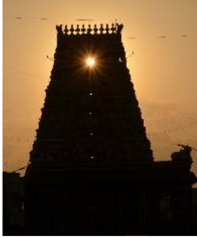
Kapaleeswarar temple