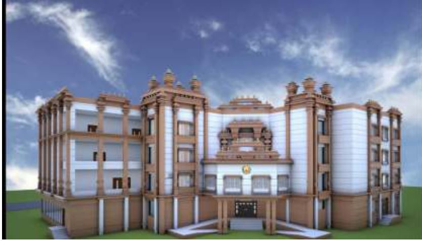
An artist's model of the Hindu Cultural and Religious Center to come up in R A Puram

The Tamil Nadu Government is to build a Hindu Religious and Cultural Center in RA Puram to host and promote Hinduism-based cultural activities and related projects in this field.